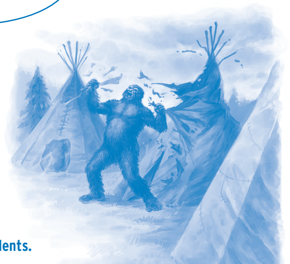
Illustration © 2010 by Jim Nelson from Looking for Bigfoot

Educators: Reproduce this activity sheet for your students.