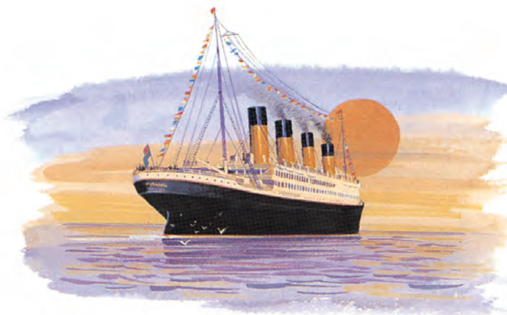
Illustration © 1987 by Keith Kohler